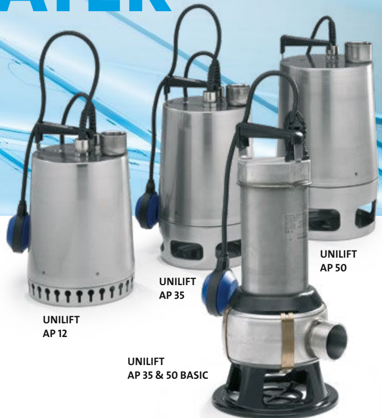
UNILIFT AP 12